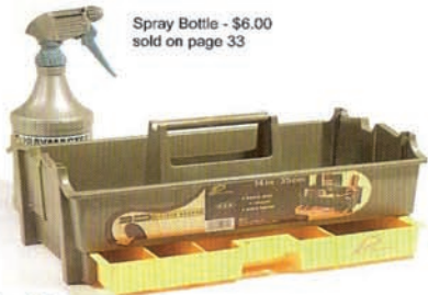
Spray Bottle - $6.00 sold on page 33

Tool Tray A2602 (9" x 14" x 4" deep) Sturdy plastic design with easy carry handle, to hold all of your tools.