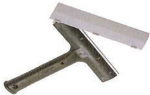
6" Black Triumph Scraper A1504 Uses B145 or B145S