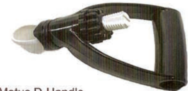
Motus D-Handle A1400D Make your Performax or Pro handle two-handed with this tool. Great for security film installations when extra leverage is needed.