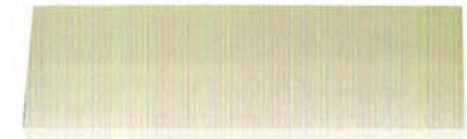
Clear Max Blade B3702 (5" x 2") Cousin of the popular Blue Max, the clear is a slightly softer version (lower durometer).