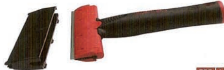
NEW! 6" Triumph Soft Grip Scraper A1504SG Uses B145 or B145S