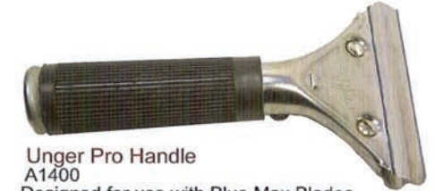
Unger Pro Handle A1400 Designed for use with Blue Max Blades sold below and channel blades sold on page 22.