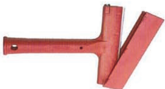
6" Red H/D Triumph Scraper A1504H Great for film removal. Uses B145H