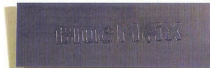
Blue Max Blade without angle B3701N (5" x 2") B3701SN (5" x 1 3/8") The best choice for maximum water removal from automotive or flat glass installations. These blades are a favorite for those who install security film. The smaller blade works to remove more water on your thickest security film jobs.