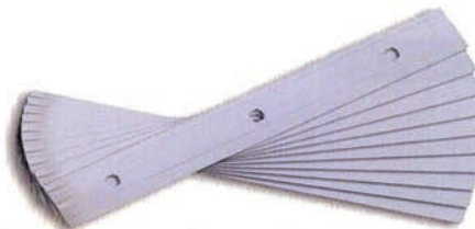
6" H/D Triumph Scraper Blades B145H (10 Blades)