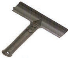
6" Triumph Scraper Retractable A1504R Uses B145 or B145S