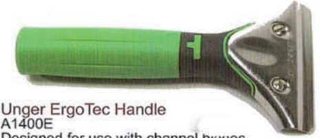
Unger ErgoTec Handle A1400E Designed for use with channel blades sold on page 22.

A1400P (Handle Only) A1400G (Replacement Grip) The Performax Handle with the Blue Max beveled & non-beveled blade allows you to handle any installation. 5" wide squeegee contact area with two stainless steel clamp screws to keep your blade where you want it. 8" overall length to fit even the largest of hands. Threaded handle to accept standard extensions for two handed work. Lightweight cast aluminum design gives you strength without extra weight.