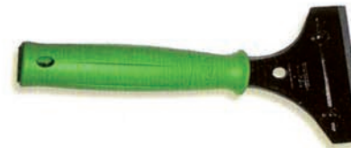
Unger Ergotec Scraper A1507E Uses B135 or B135S