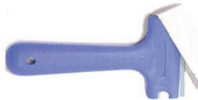
3" Triumph Handy Scraper A1505 Uses B111 - For hard to reach areas and small windows.