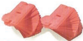
NEW! 100-Pack Double Edge Plastic Scraperite Razor Blades (200 edges)