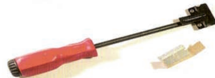
Clip Scraper A1475 Use B122 or hard card for hard to reach areas.